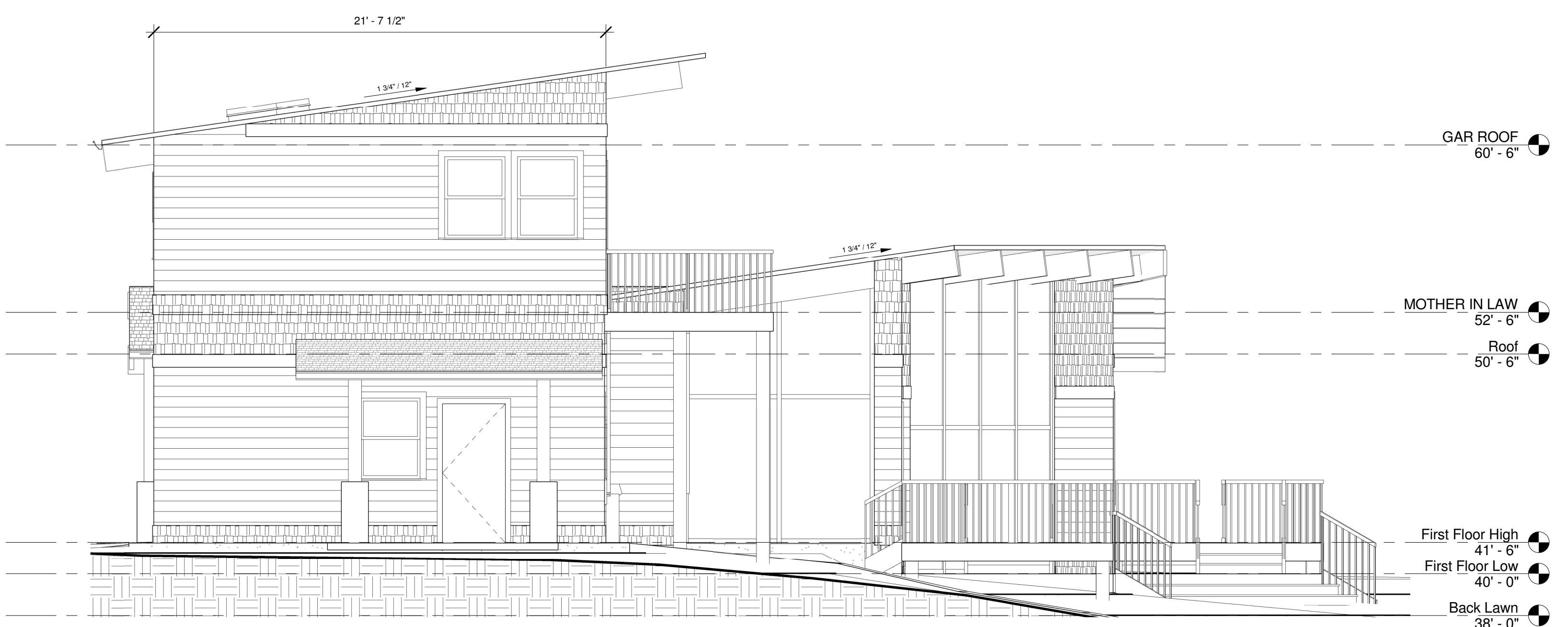
④ S WEST 1/4" = 1'-0"